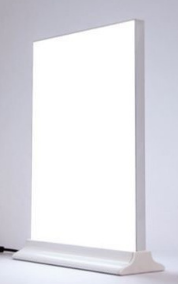
Super bright panels